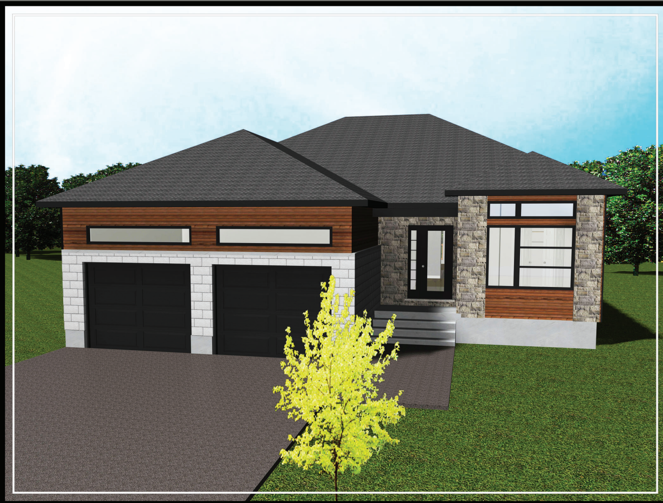
Artist Concept - Not to be used as an Official Document.