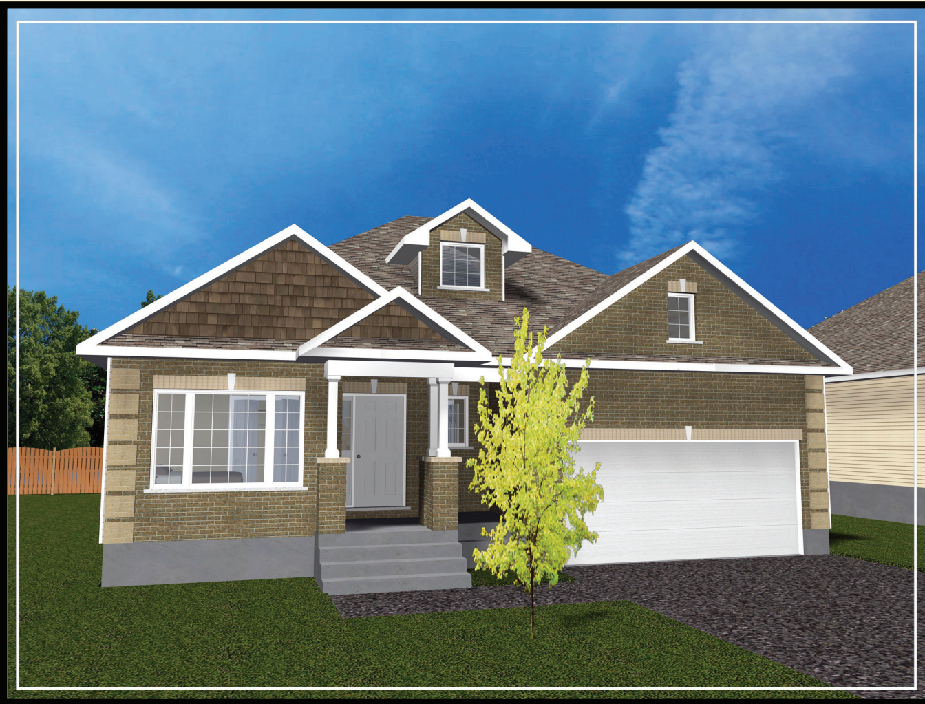
Artist Concept - Not to be used as an Official Document.