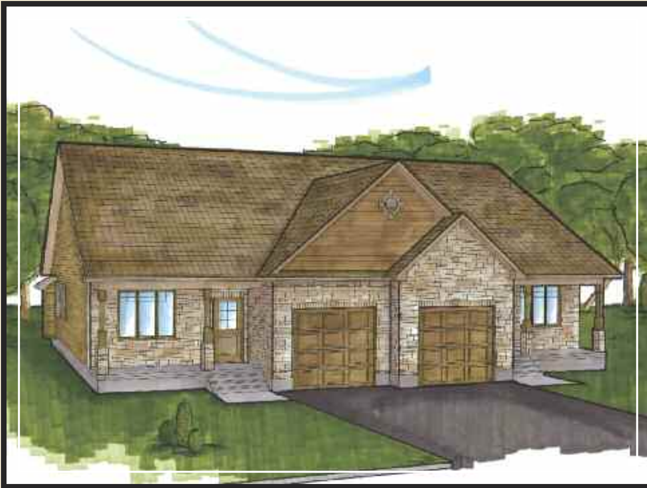
Artist Concept – Not to be used as an official document.