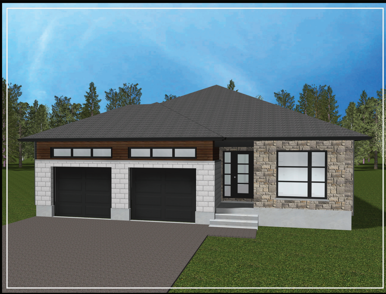
Artist Concept - Not to be used as an Official Document.