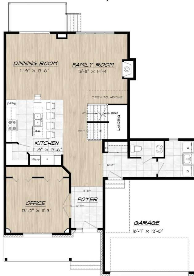
Main Floor Plan Living Area: 2242 sq. ft.