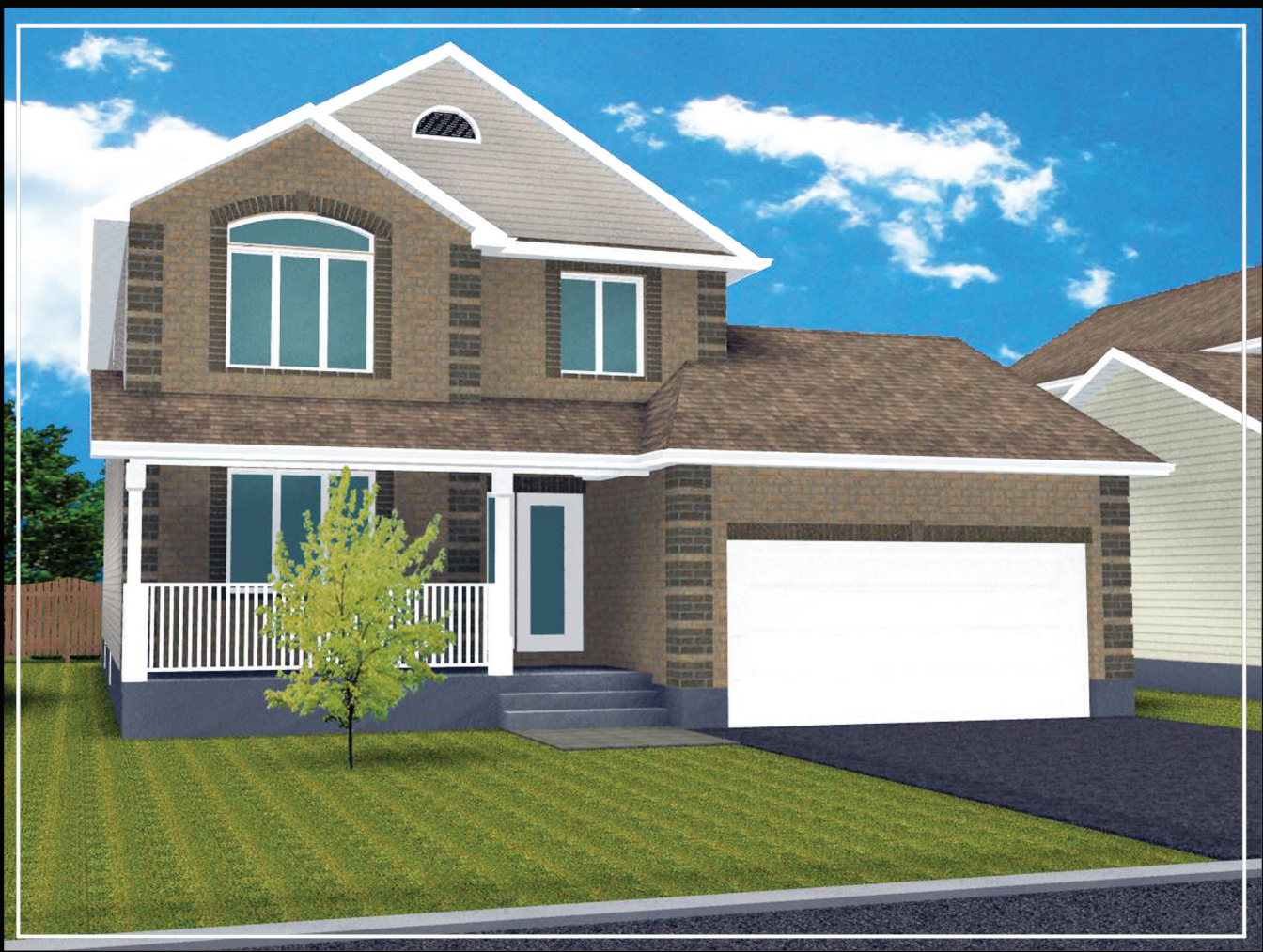
Artist Concept - Not to be used as an Official Document.