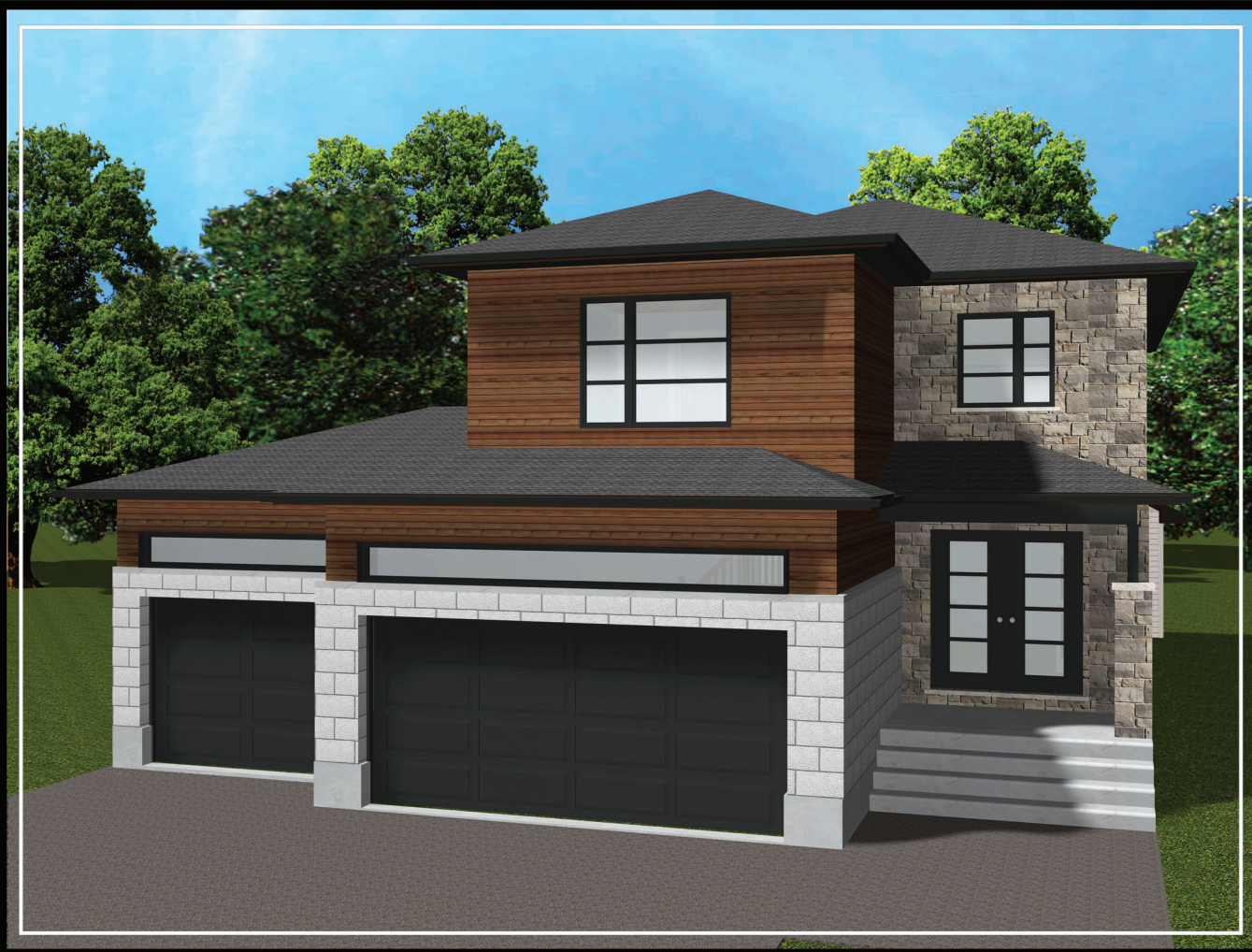
Artist Concept - Not to be used as an Official Document.