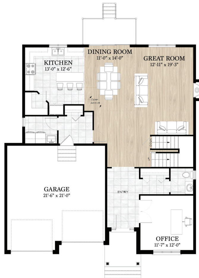
Main Floor Plan Living Area: 2610 sq. ft.