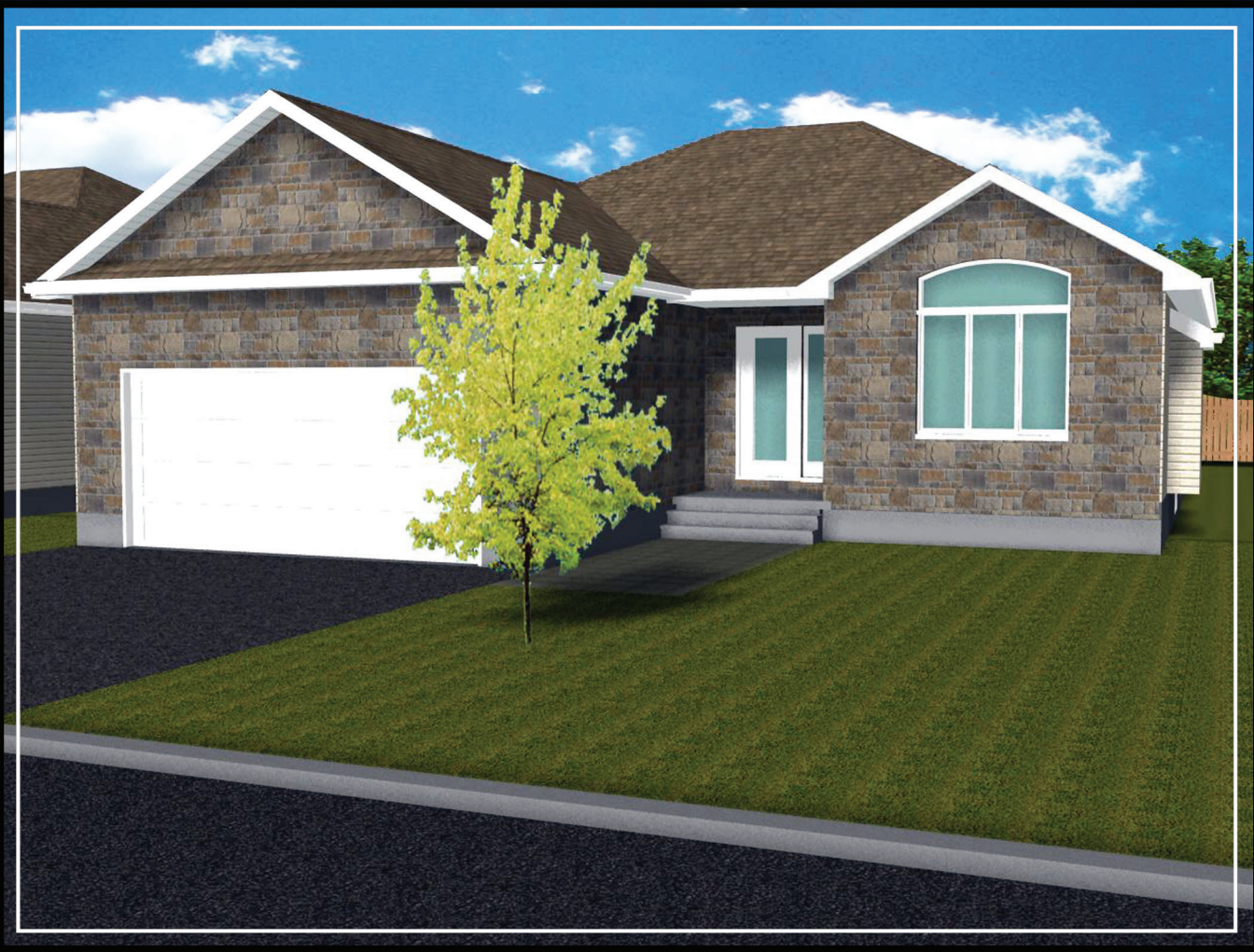
Artist Concept - Not to be used as an Official Document.