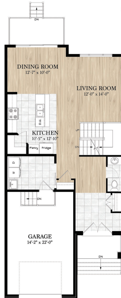
Main Floor Plan Living Area: 1999 sq. ft.