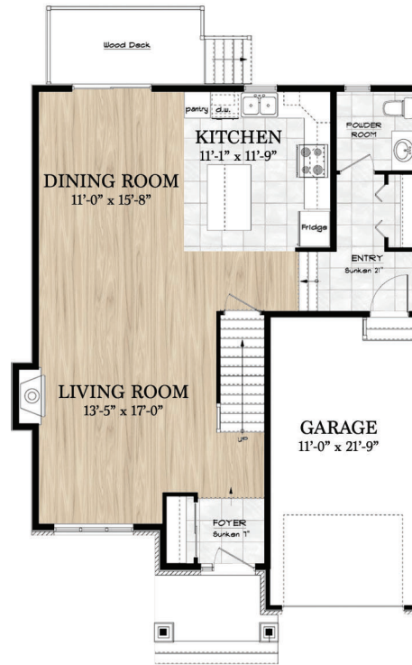
Main Floor Plan: 814 sq. ft.