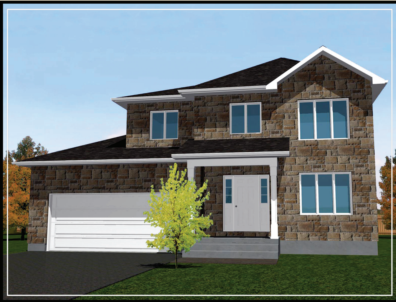
Artist Concept - Not to be used as an Official Document.