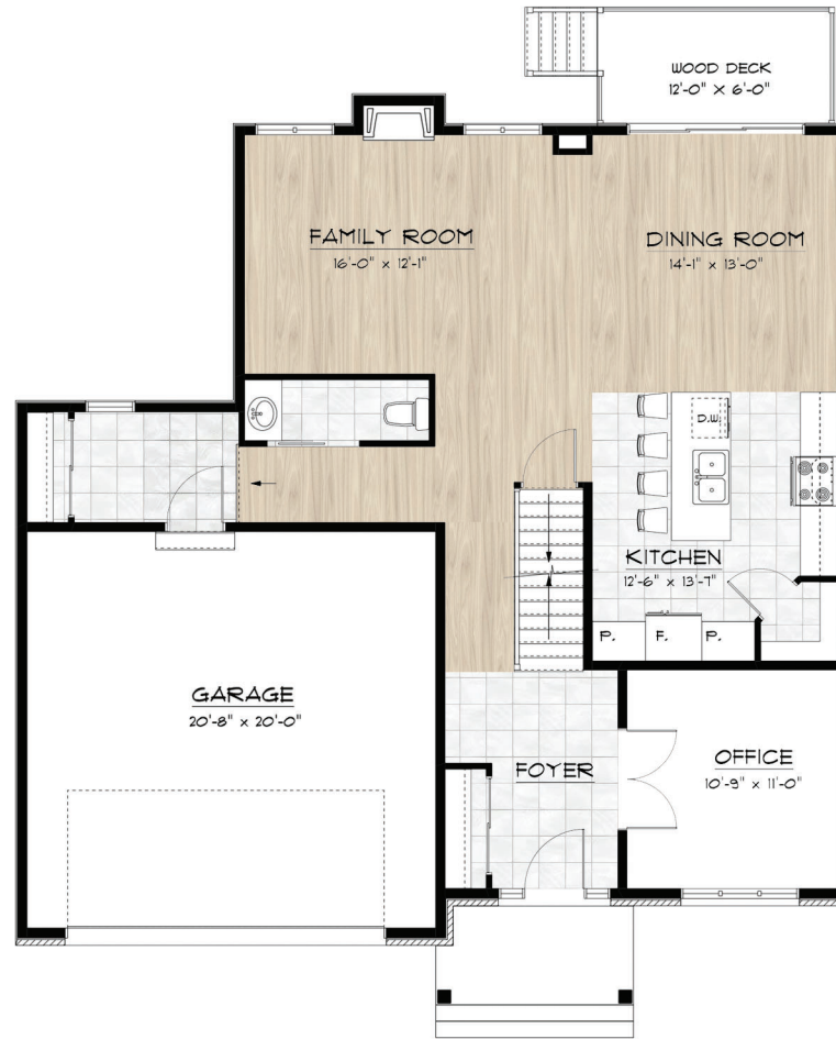
Main Floor Plan Living Area: 2289 sq. ft.