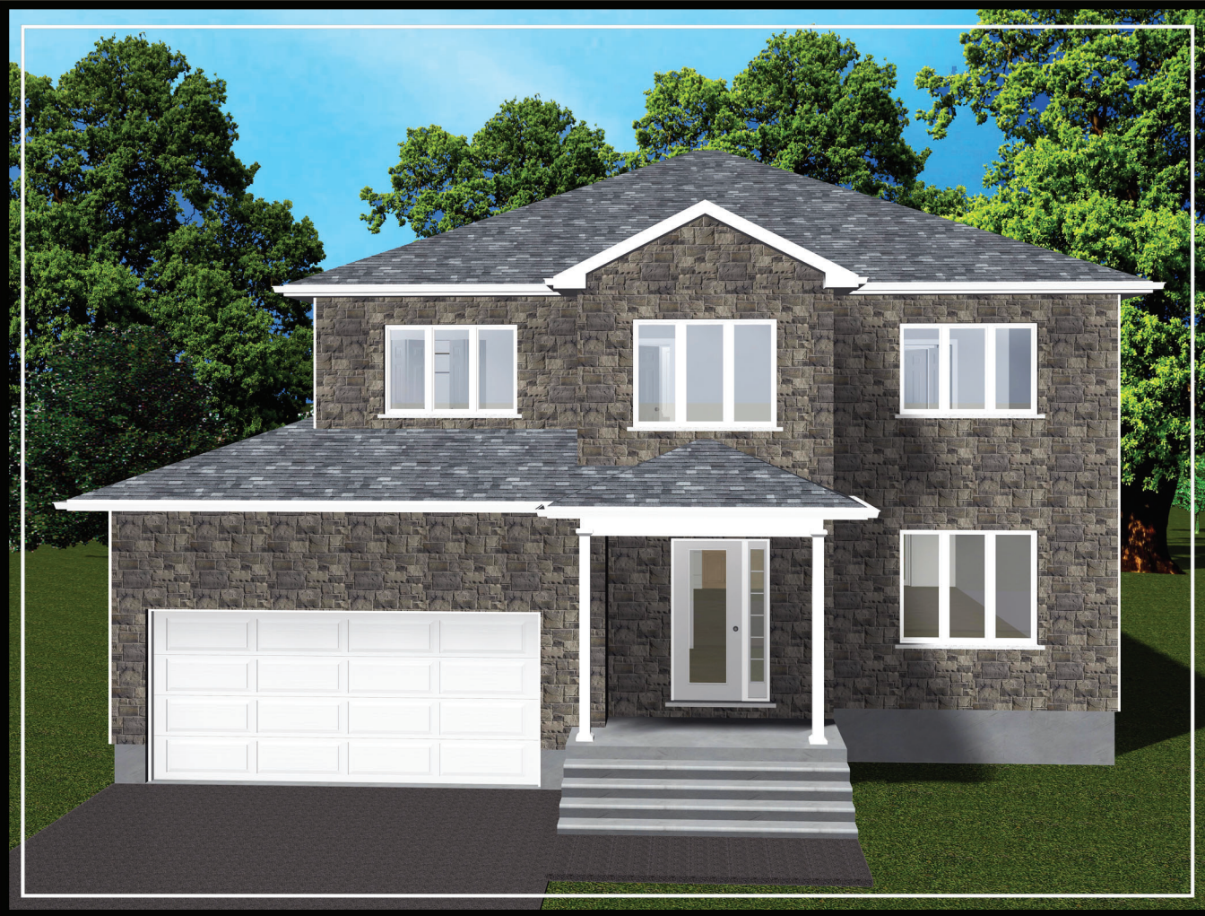
Artist Concept - Not to be used as an Official Document.