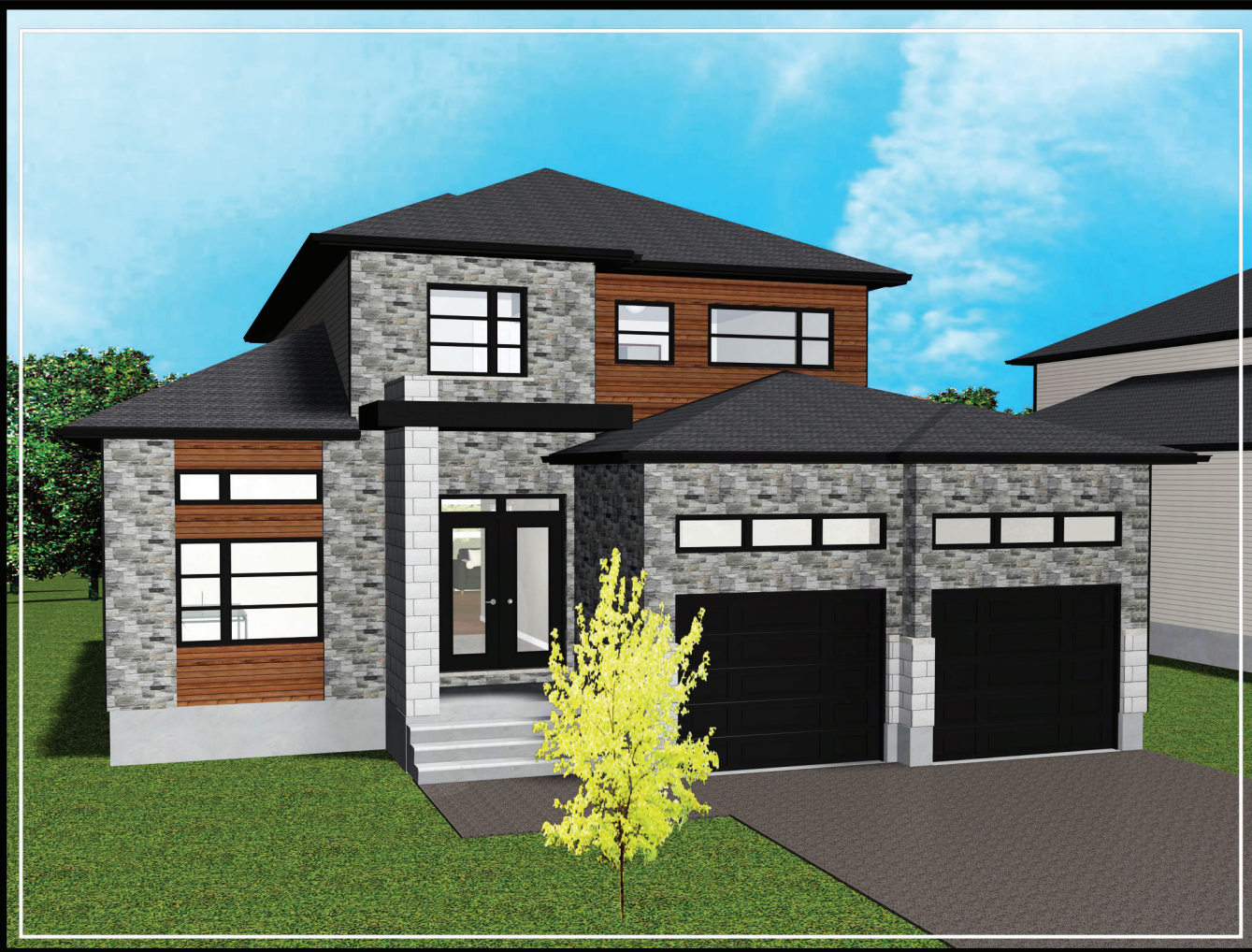
Artist Concept - Not to be used as an Official Document.