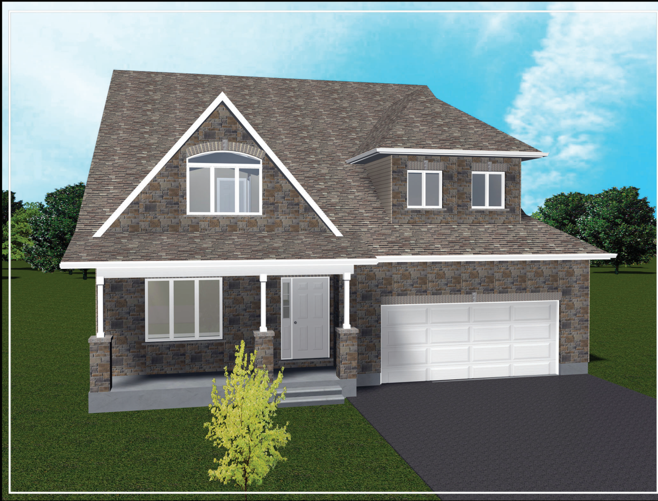
Artist Concept - Not to be used as an Official Document.