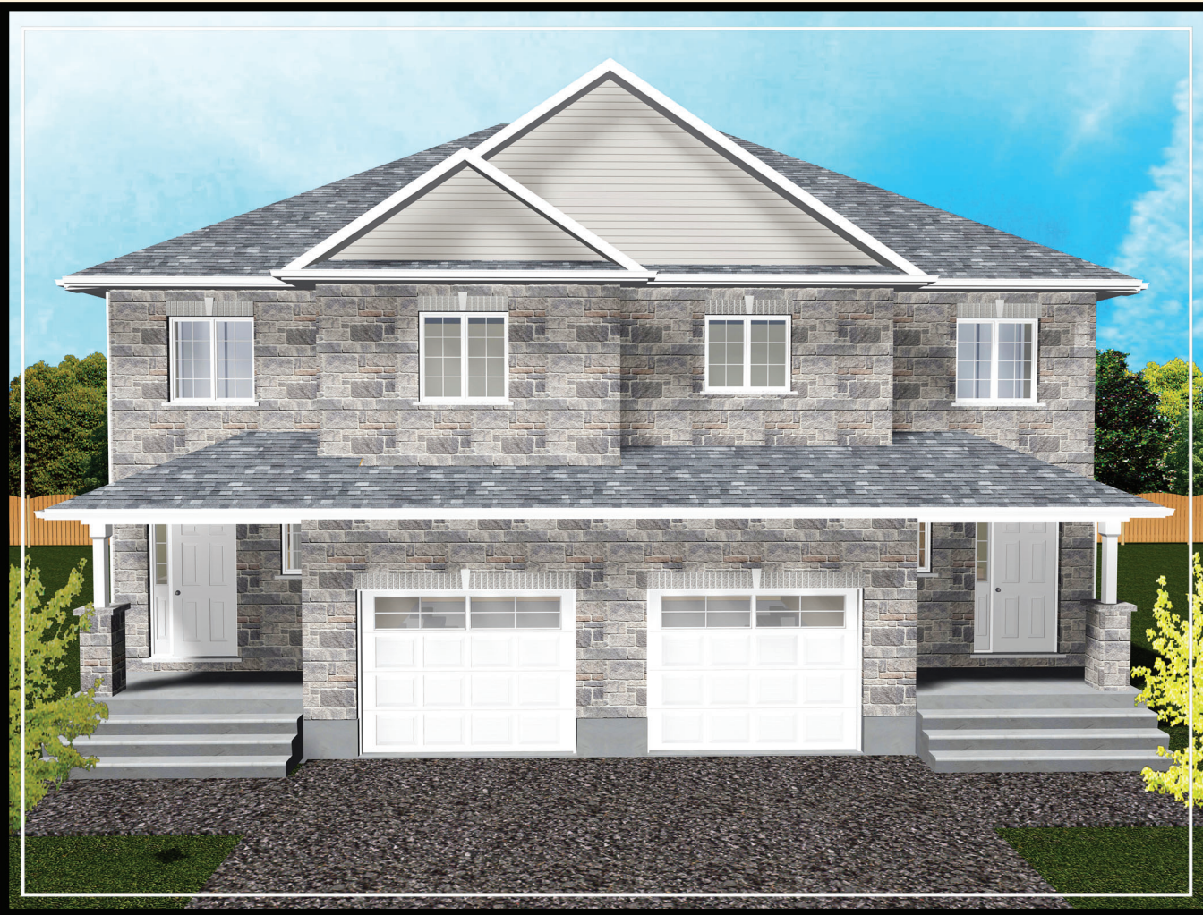
Artist Concept - Not to be used as an Official Document.