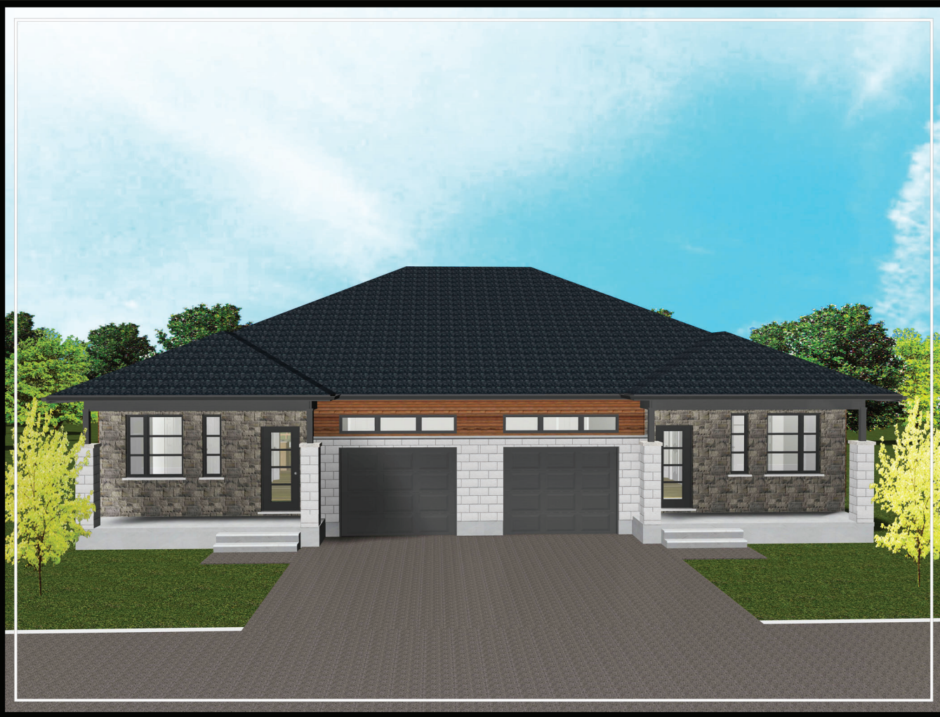
Artist Concept - Not to be used as an Official Document.