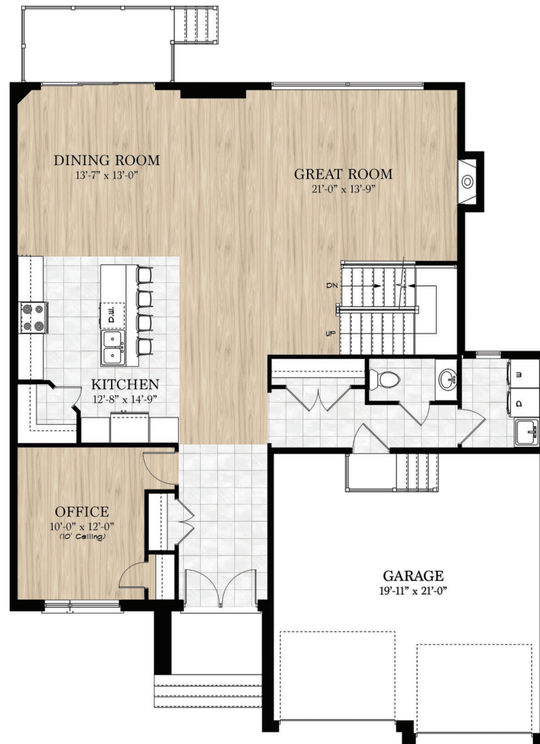
Main Floor Plan Living Area: 2344 sq. ft.