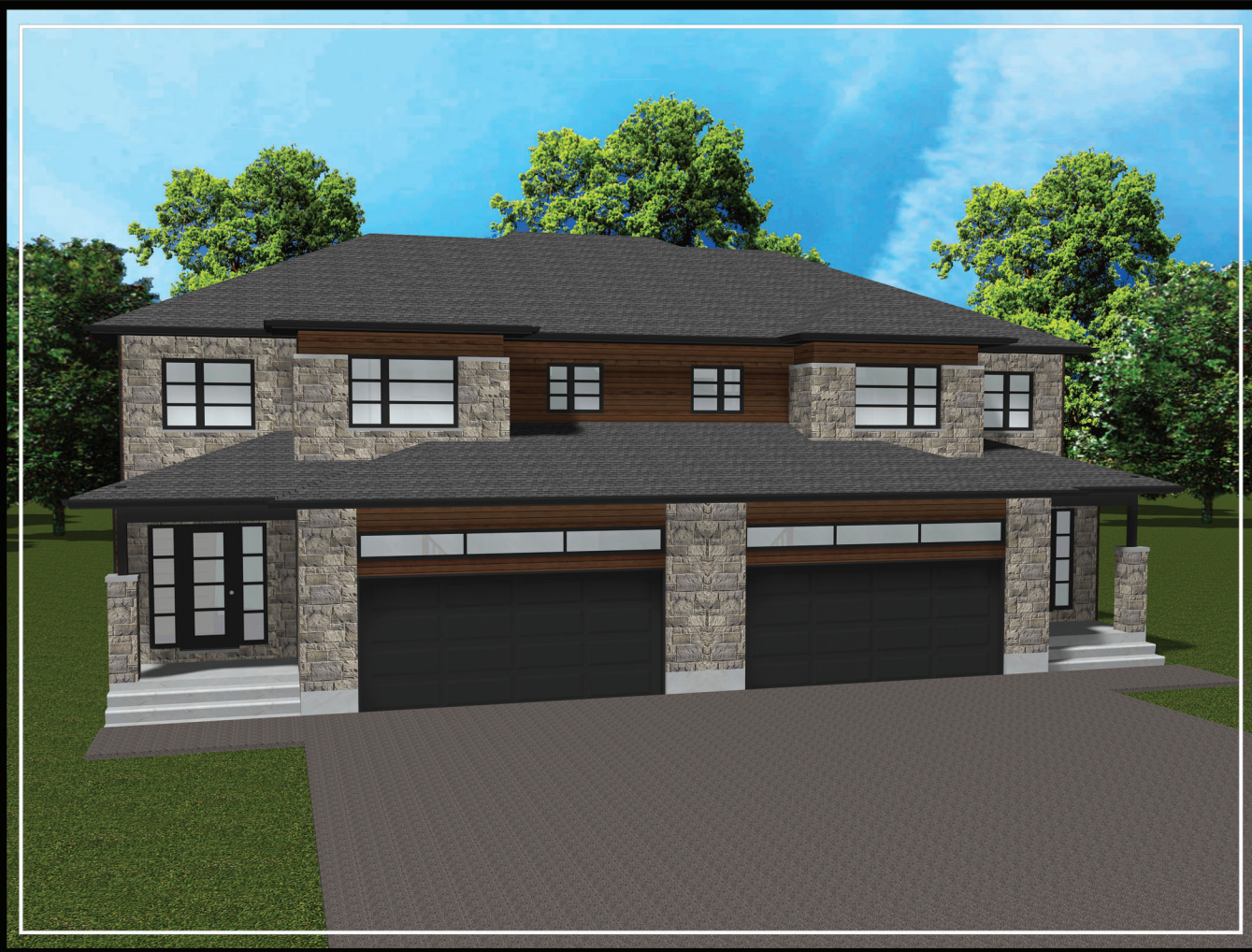
Artist Concept - Not to be used as an Official Document.