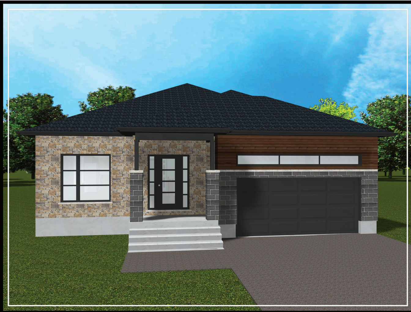
Artist Concept - Not to be used as an Official Document.