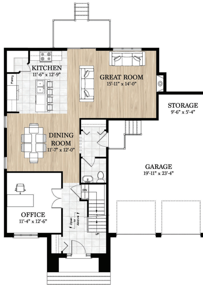
Main Floor Plan