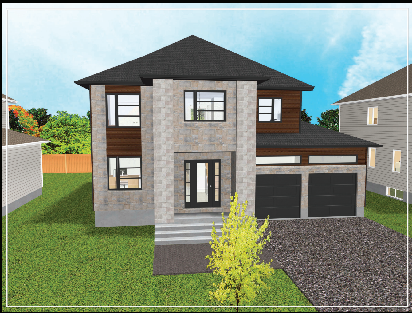
Artist Concept - Not to be used as an Official Document.