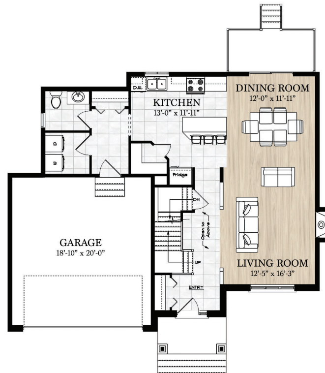
Main Floor Plan Living Area: 1843 sq. ft.