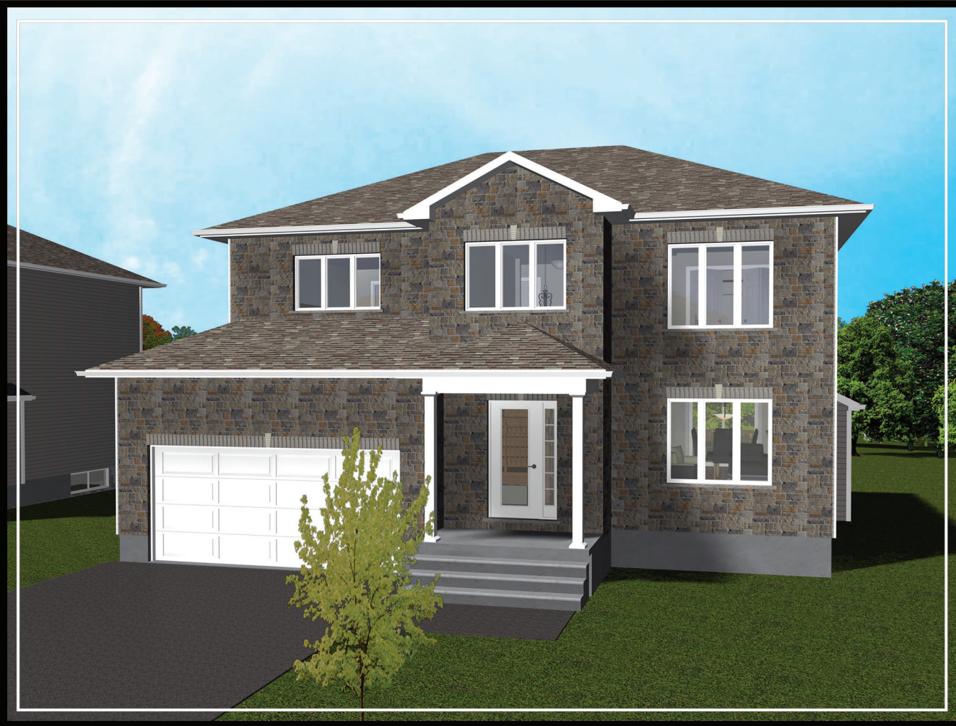
Artist Concept - Not to be used as an Official Document.