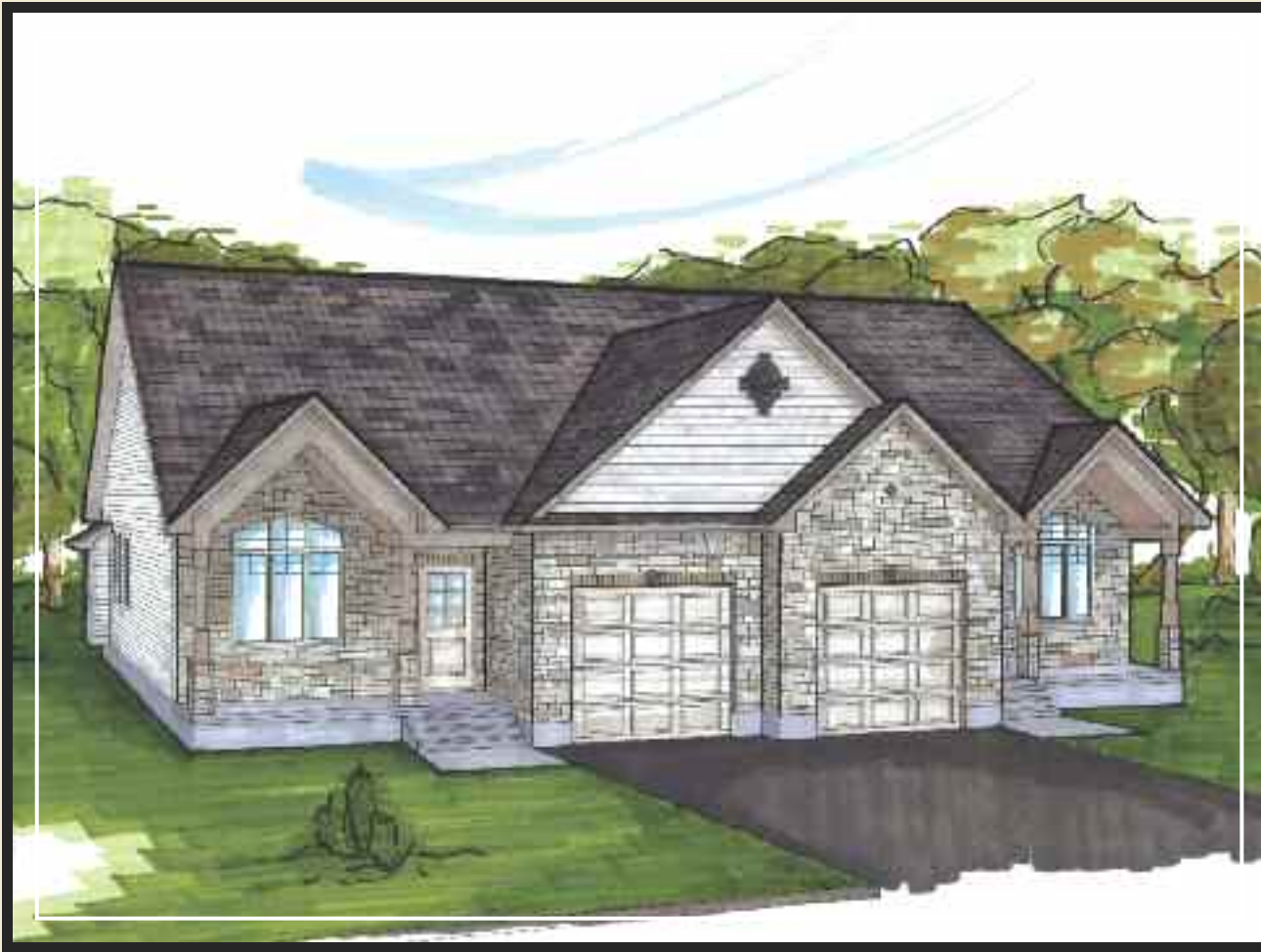
Artist Concept – Not to be used as an official document.