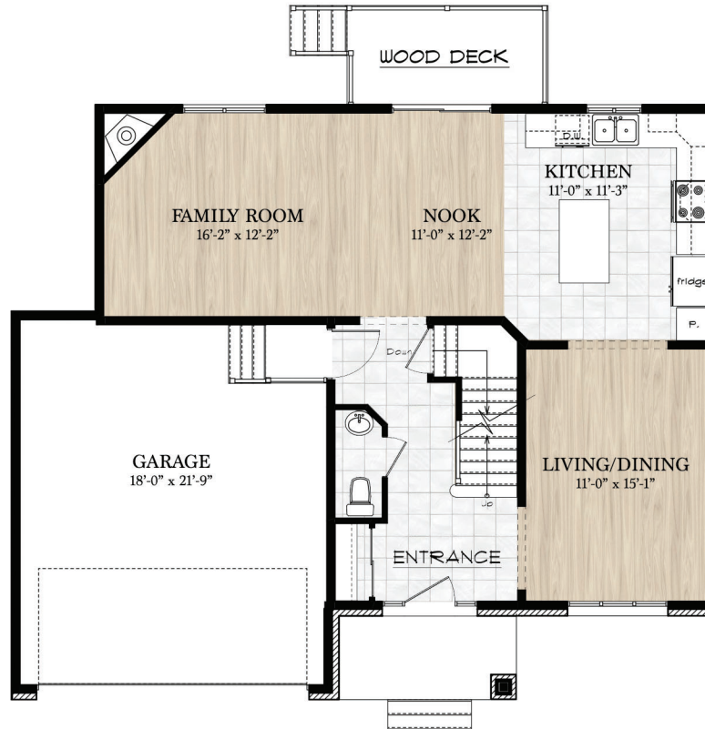
Main Floor Plan 2002 sq. ft.