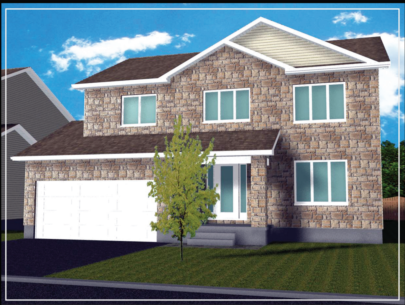
Artist Concept - Not to be used as an Official Document.