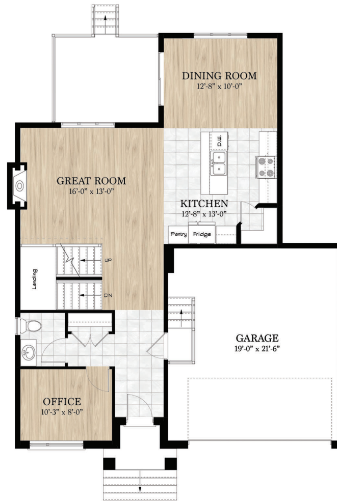
Main Floor Plan Living Area: 1853 sq. ft.