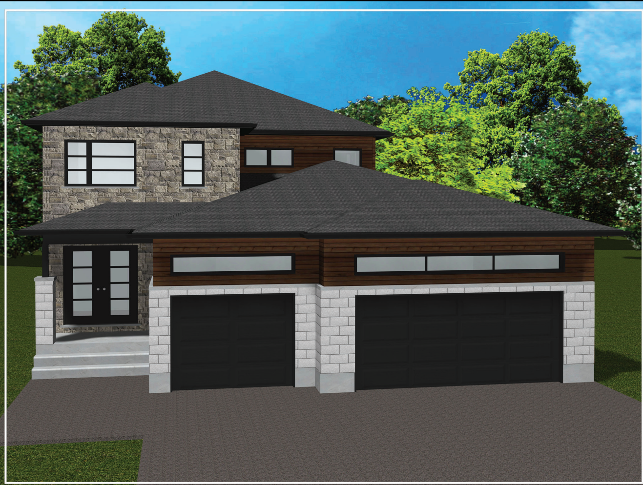
Artist Concept - Not to be used as an Official Document.