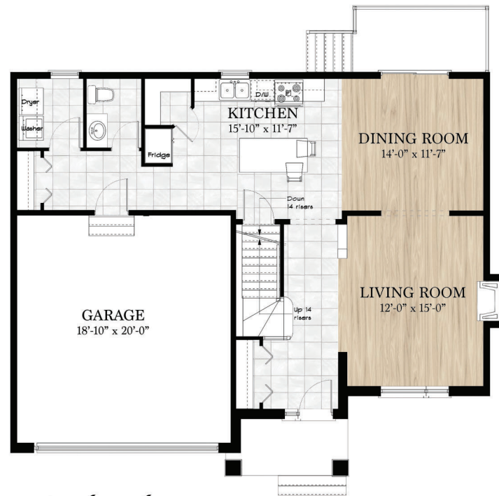
Main Floor Plan Living Area: 1775 sq. ft.