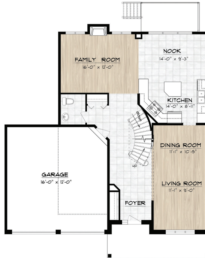
Main Floor Plan Living Area: 2273 sq. ft.