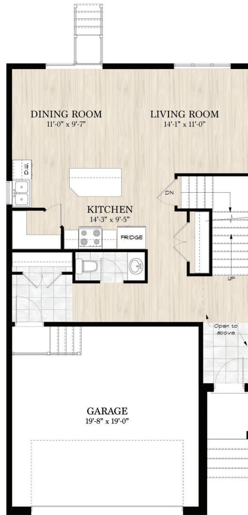
Main Floor Plan Living Area: 1623 sq. ft.