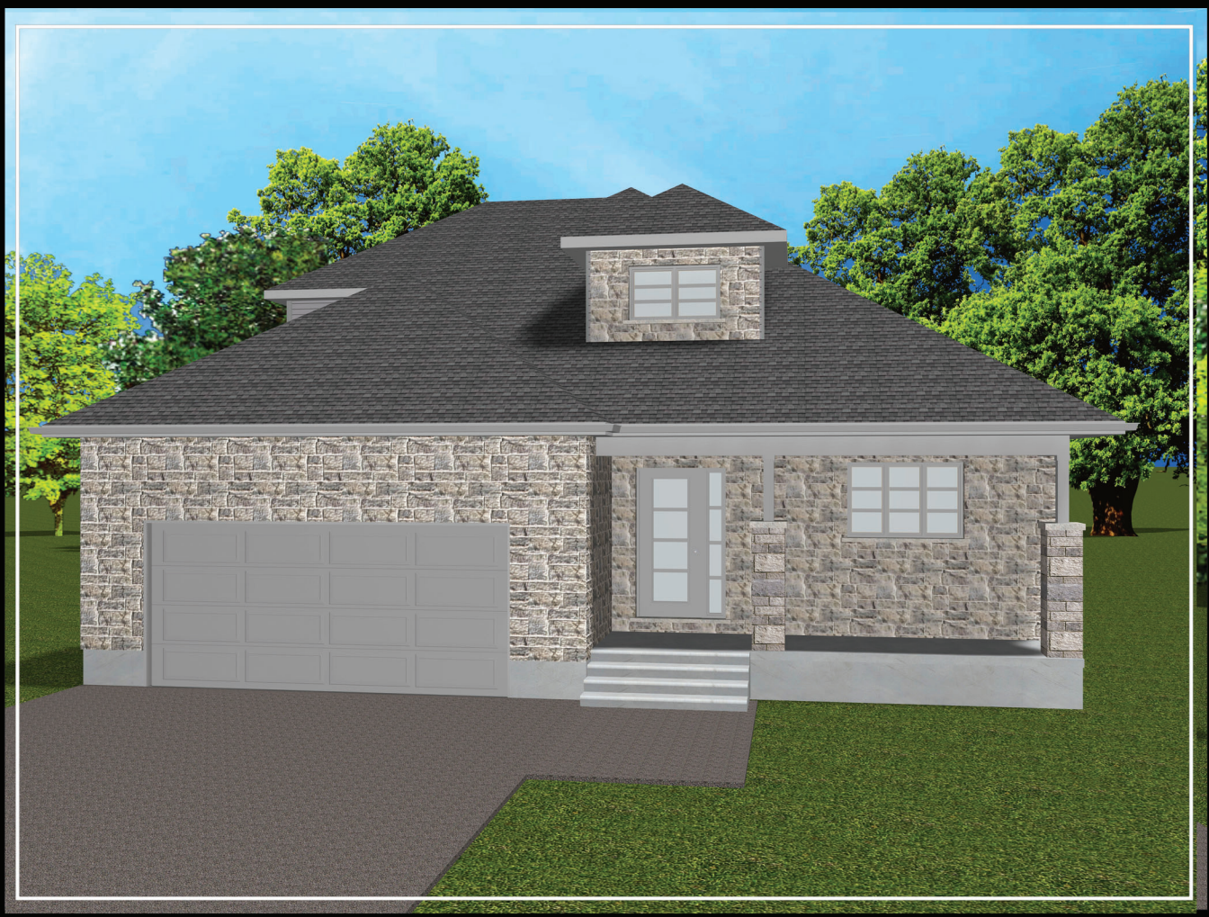
Artist Concept - Not to be used as an Official Document.