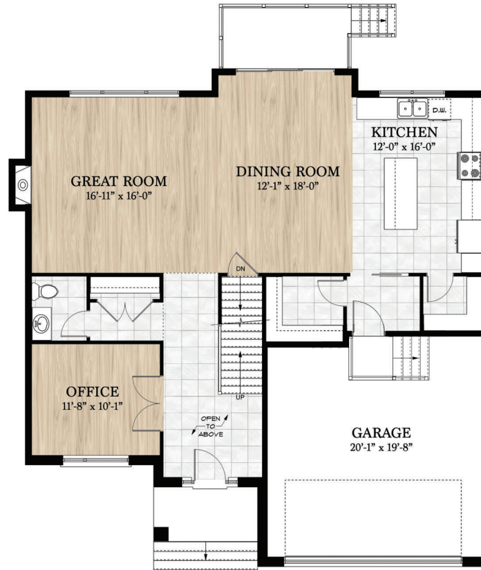
Main Floor Plan Living Area: 2291 sq. ft.